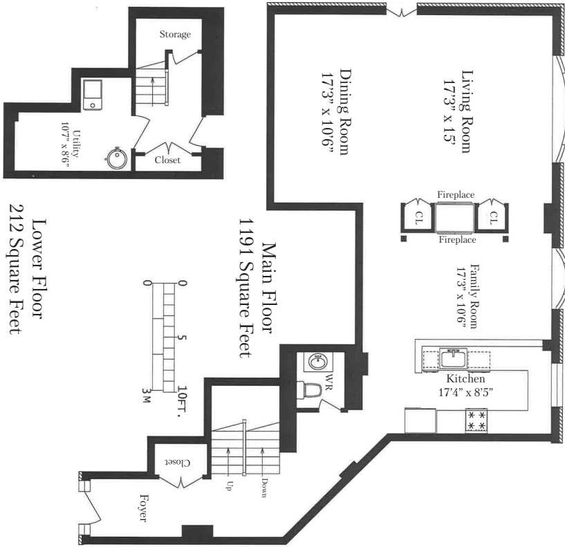
Main Floor 1191 Square Feet